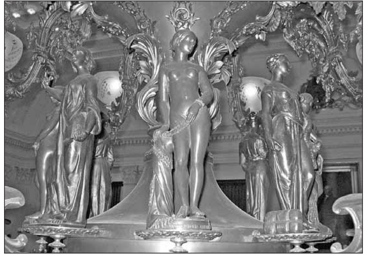
One (of four) Greek Slaves on the House gasolier, which was made expressly for our State House.

In those days just before our Civil War, the debate over slavery raged. The work's visual subject, one of the first non-Biblical naked females by an American sculptor, was also a somewhat daring choice. Powers knew this, however, and had armed this "hapless, unconsenting, pure maiden"