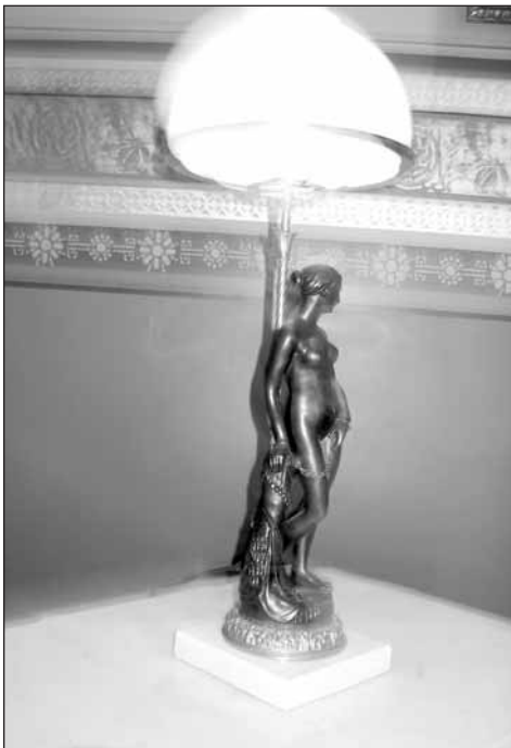
Desk lamp of the Greek Slave, in the Cedar Creek Room during legislative session, will move to the Governor's Office during tourist season. There it will include a gas hose connection from the Partners' Desk to the restored gasolier, demonstrating how light was originally provided to a working surface.

The Greek Slave first became famous from reports of visitors to the sculptor's Florence studio and was bought by an Englishman, who later exhibited it in London's Crystal Palace exhibition of 1851. By that time, Powers had made five other versions, each slightly different. Four are now in the U.S.A.